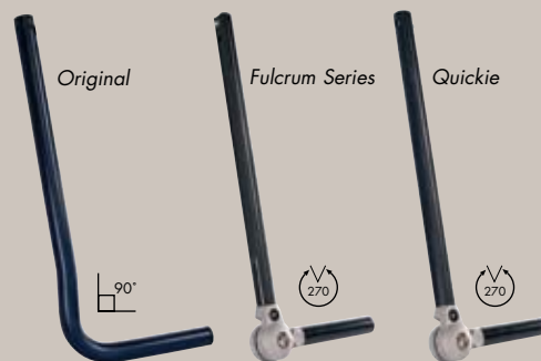
EXTENSION TUBES Ø3/4" (19mm)