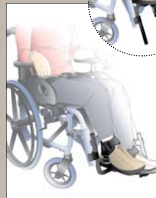
Improved foot support with Ankle Huggers® and Adjustable Angle Footplates (one mounted inverted for greater height)