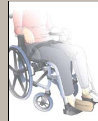
Plantar flexion and inversion

Adjustable Angle Footplates accommodate fixed posture and fully supports the foot. Adjusts in dorsi/plantar flexion, height and depth.