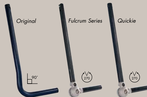
EXTENSION TUBES Ø3/4" (19mm)