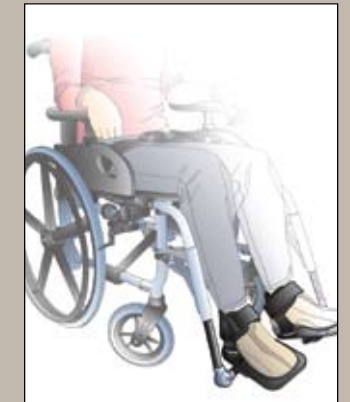
Improved foot support with Fulcrum Series Footplates and Ankle Huggers®

Fulcrum Series Footplates accommodate fixed posture and fully supports the foot. Adjusts in inversion/eversion, dorsi/plantar flexion, height and depth.