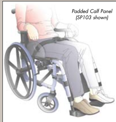
Padded Calf Panel (SP103 shown)