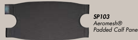
SP103 Aeromesh® Padded Calf Panel