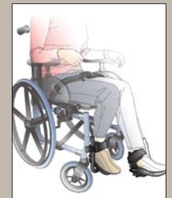
Corrected foot position with Ankle Huggers® and Adjustable Angle Footplates