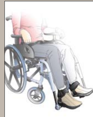
Improved positioning with Ankle Huggers®