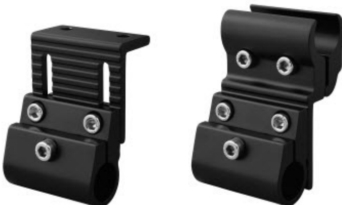
1. PC010 Tri-Lock, Modular Clamp, Rail Mount: Fits Permobil Unitrack

On January 1st, Bodypoint replaces the original Tri-Lock Mounting Clamp with two new versions.